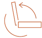
Adjustable signal direction