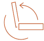
Adjustable signal direction