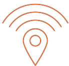
Extended Flight Range