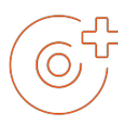
Improved video signal