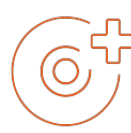
Improved video signal